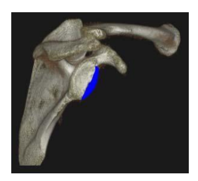
<u>Figure 1:</u> A 3D CT reconstruction of the scapula. The blue segment illustrates the bony deficit of the glenoid.

When bony lesions reach critical dimensions, reconstruction of this deficit using autograft bone yields the best surgical results. The Latarjet procedure is the most popular and highly effective, transferring the distal coracoid into the bony defect.<sup>3</sup>